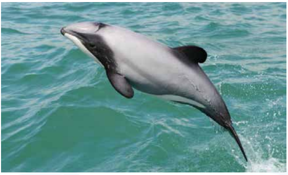
Harbor porpoise (Phocoena phocoena) (top), Franciscana dolphin (Pontoporia blainvillei) (above): species for which multiple pinger trials have shown reduction in bycatch