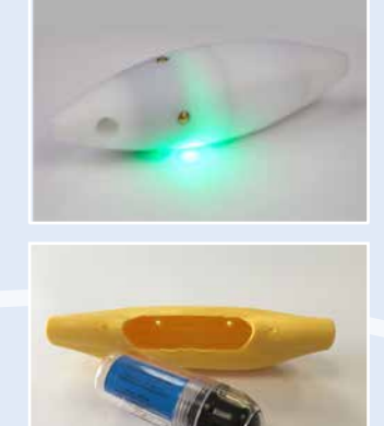
Examples of pingers: (top) a 70kHz pinger with an LED; (above) a Fishtek "banana pinger."