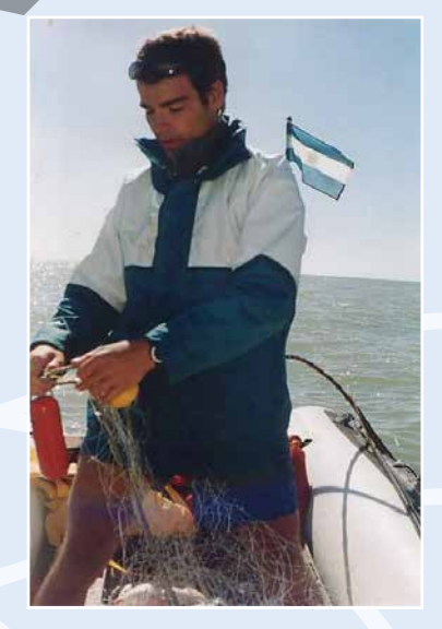
An Argentine gillnet fisherman using a Dukane pinger. Several pinger trials in this fishery have shown that pingers produce significant reductions in bycatch of Franciscana dolphin (Pontoporia blainvillei) .

higher sound outputs to keep animals at bay, often by inflicting pain or discomfort, whereas Acoustic Deterrent Devices (ADDs) typically attempt to alert or warn marine mammals about the presence of fishing activity, but similarly seem to function by excluding animals from an area. Although the difference is not always clear-cut, this factsheet uses the convention of making a distinction between AHDs and ADDs, arbitrarily using 180dB as the dividing line for how to designate one type versus the other (Long et al., 2015). Acoustic deterrents have been tested in gillnet, trap, and trawl fisheries. AHDs are frequently used in aquaculture operations to keep seals and sea lions from preying on farmed fish. Also known as "seal scarers," these devices are intended to harass using sound. Several field evaluations of different versions of these devices have shown a temporary deterrent effect. However, the seals that were exposed to the sounds eventually overcame their initial avoidance of the ensonified area--that is, they habituated to the noise (Geiger and Jeffries, 1987; Gearin et al., 1988; Fjällinga et al., 2006). No study of whales has yet occurred as part of a fishing operation. However, behavioral studies so far have not indicated that acoustic deterrents are an encouraging strategy for reducing entanglements in gear.